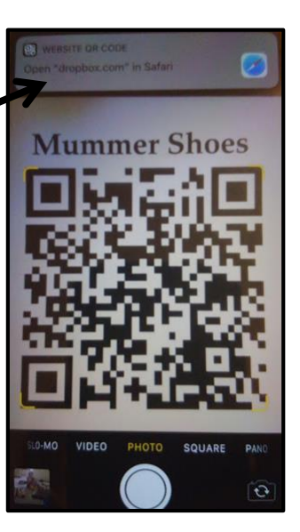
Step 2 : Continue to the audio file website (Dropbox):

An automatic pop-up will direct you to the audio website. Click on this pop-up.