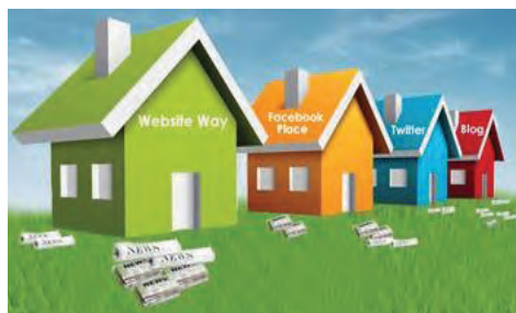
No Content, Outdated = Poor First Impression