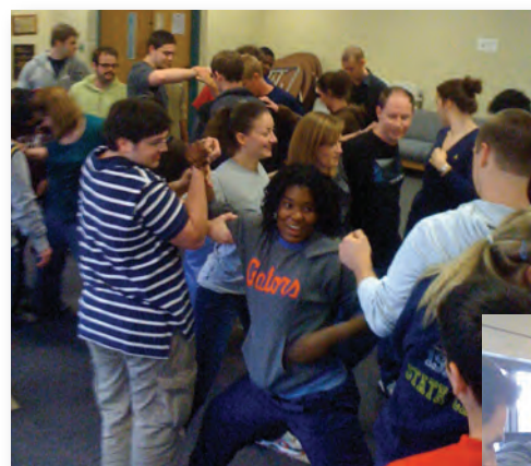
Left: As a wrap-up activity, all members of the Student Council were charged with “Crossing The River.” The activity realized different leadership qualities in different individuals, but reinforced the importance of working together.

Only time will tell if the efforts of the Conference will be realized, but with the overwhelming participation by student leaders, it is hopeful that a greater sense of community will begin develop on campus!