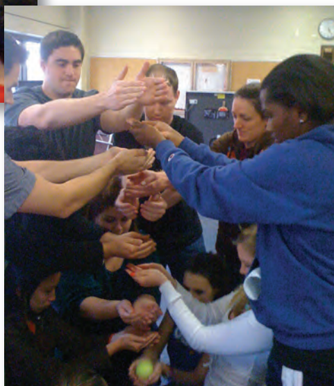
Right: Student leaders of the Temple University School of Podiatric Medicine work together during this activity to see how efficiency can be accomplished, while limiting error. They also had to determine how to maintain efficiency when members of their group were prohibited from participating!