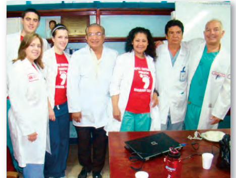
TUSPM Surgical mission team

The TUSPM Alumni Association Board assisted with the student's expenses in order to complete the mission trip and expressed hopes for this project to become continual at TUSPM.