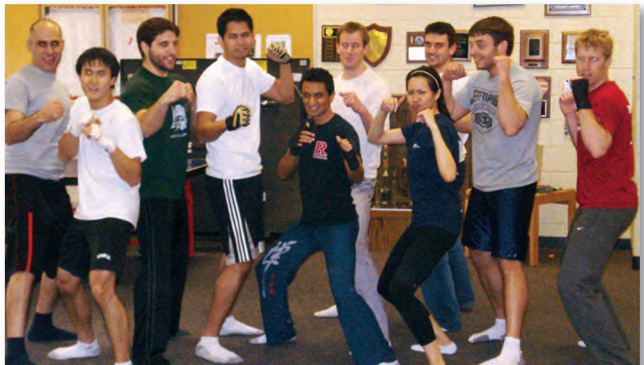
Members of the Martial Arts Club 2010-2011

Search for our Facebook group to see videos and photos of us in action! Contact us at tuspmTMA@gmail.com with any questions.